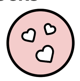
Passion Projects (Create)