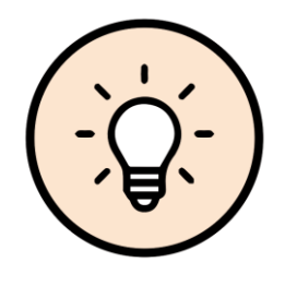
Explore! (Self-Directed Topics/Challenges)